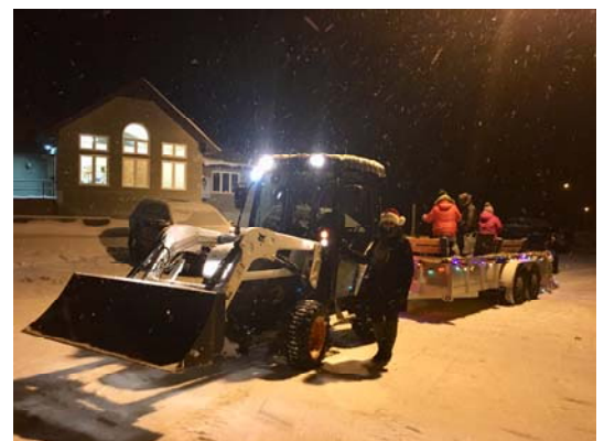
Community Caroling Tractor Ride